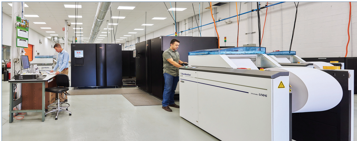
Depending on the nature of the job, printed rolls are transferred to one of two combination lines for book block production or processing into finished booklets on the Horizon StitchLiner 6000 Digital Saddlestitcher.

changed – shorter run lengths and faster turn times drive a move to a digital environment. Offset is not going away, but we understand that our clients need a blended manufacturing platform, and that's what we are delivering."