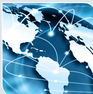
Worldwide network of experts