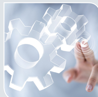
Support from specialists