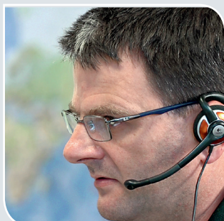
10 hours/year support included