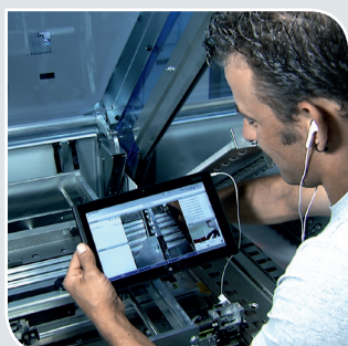
Access monitoring – @live test