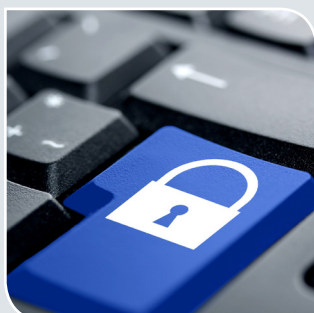
Highest level of security